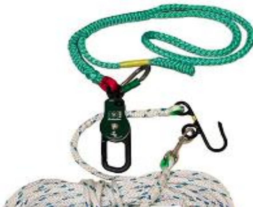
50061A-4/80-Ox Block 80' Handline Kit