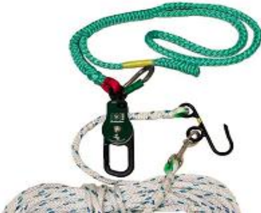
50061A-4/80-Ox Block 80' Handline Kit