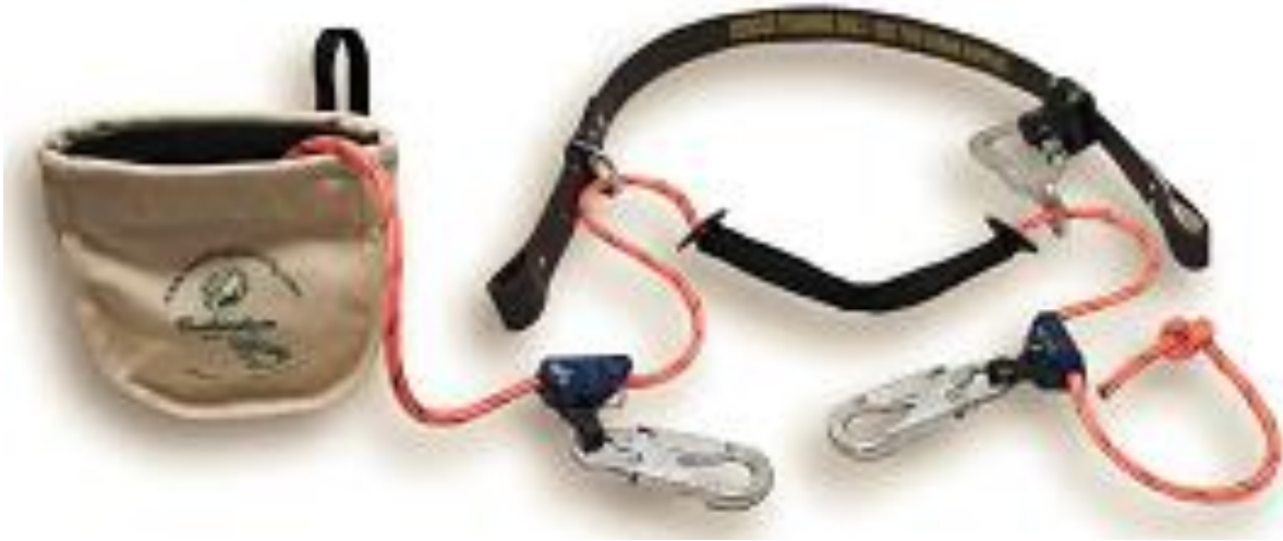
Buckingham 488PR-Rescue Super Squeeze

The mannequin should be moved smoothly to the ground, without contacting the pole. Time is over when the mannequin is on the ground and the rope is slack. Mannequin initial contact with ground must be within the work circle. Exceeding 4 minutes to complete the event will result in a two-point deduction. Using a length of 3" PVC conduit between the rope and mannequin, judges will evaluate the rope knotted around the mannequin.